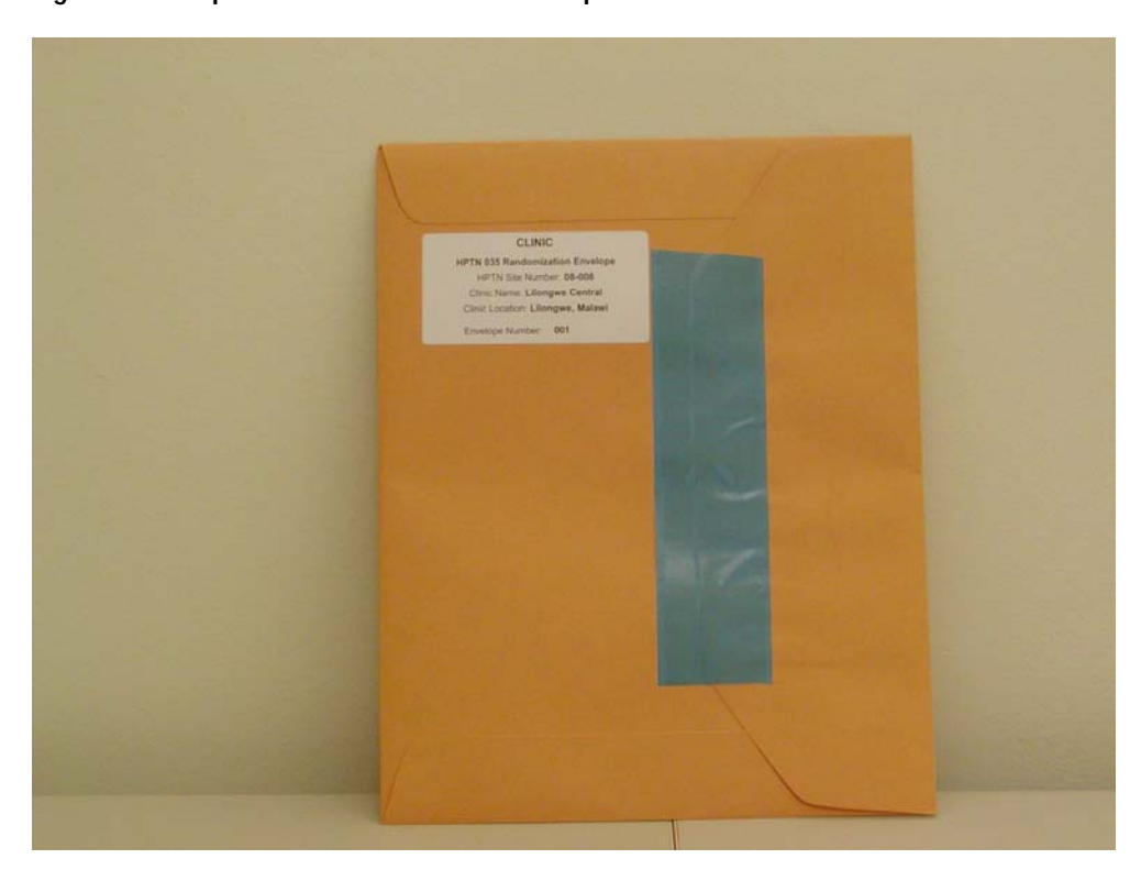
Figure 4-3: Sample Clinic Randomization Envelope