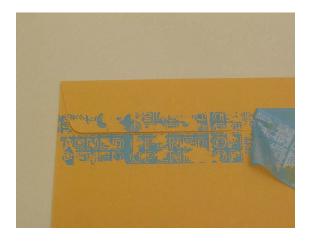
Figure 4-5: Sample Opened MTN-008 Clinic Randomization Envelope

DAIDS CRS ID: Pre-print CRS Name: Pre-print CRS Location: Pre-print Envelope Number: Pre-print